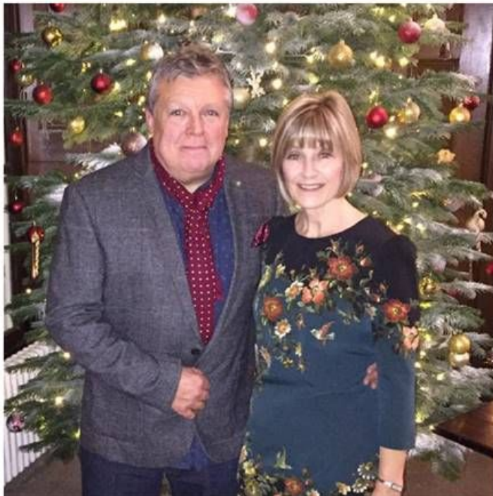
'The Lord is Good, a refuge in times of trouble, He cares for those who trust in Him' - NAHUM 1:7 #12promises