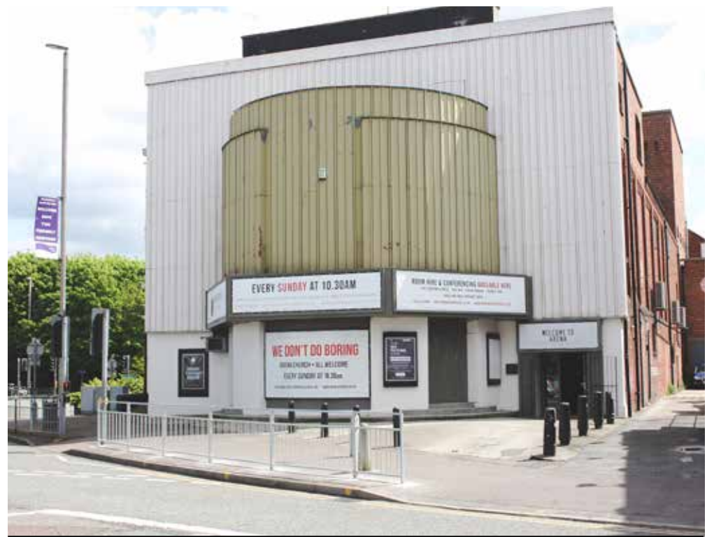
ARENA CHURCH, MANSFIELD - 66 LEEMING STREET, NG18 1NG